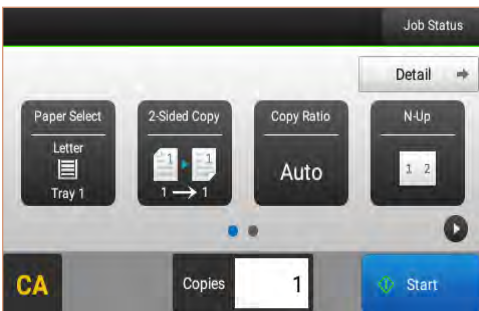
Easy Copy screen offers the most commonly used settings.