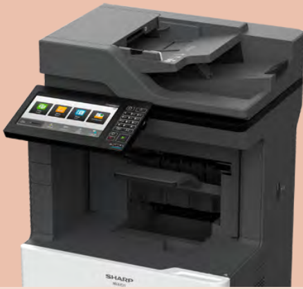
MX-B557F shown with optional inner finisher