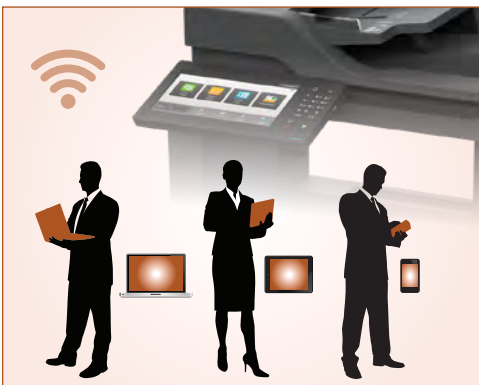
Optional wireless network interface for convenient scanning and printing from mobile devices.

*Some features require optional equipment and/or software/services.