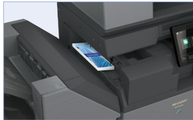
New Inner Folding Unit option offers a variety of fold patterns, including tri-fold, z-fold and others.