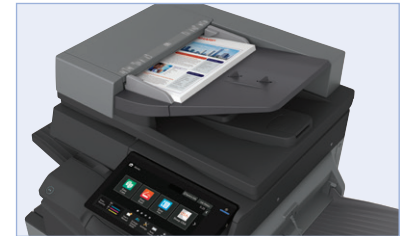
100-sheet RSPF scans documents at up to 80 images per minute.