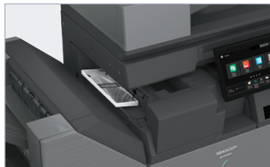
New Inner Folding Unit option offers a variety of fold patterns, including tri-fold, z-fold and others.