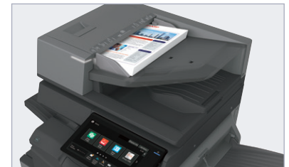
High capacity 300-sheet DSPF scans documents at up to 280 images per minute.