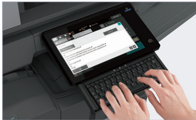
Built-in retractable keyboard simplifies email address and subject line entries.