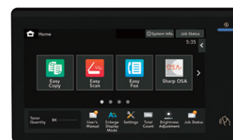
10.1" (diagonally measured) customizable touchscreen display.