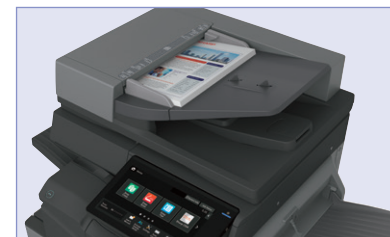
100-sheet RSPF scans documents at up to 80 images per minute.