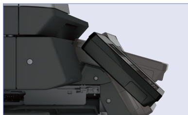
Pivoting Touchscreen offers the viewing angle for any use instantly.