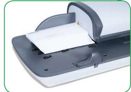
Top-loading Automatic Feeder processes up to 140 lpm / 175 lpm