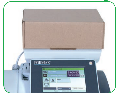
Integrated 10 lb weighing platform