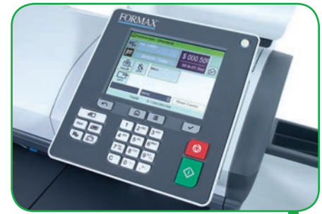
Color touchscreen and shortcut keys for easy navigation and efficient processing