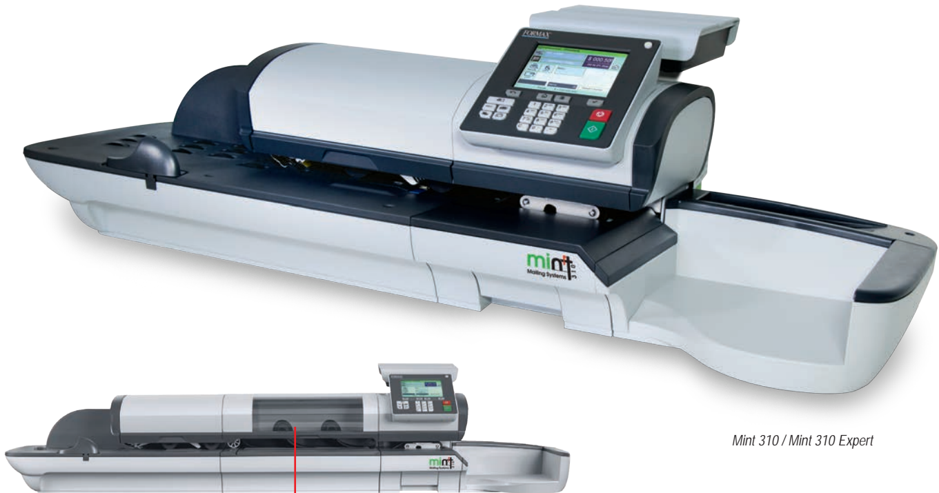
Mint 310 / Mint 310 Expert

System shown with optional dynamic scale