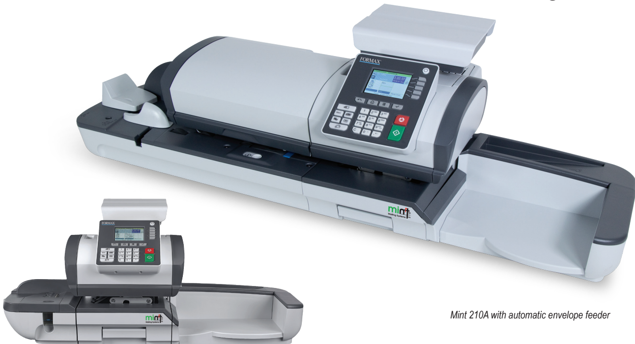
Mint 210A with automatic envelope feeder