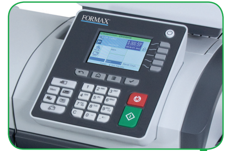
Color screen and shortcut keys for easy navigation and efficient mail processing