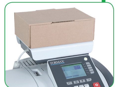
Integrated 5 lb weighing platform