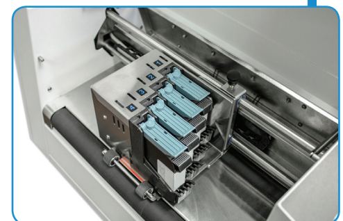
4-pen stitched single-head design

Formax - New Hampshire, USA www.formax.com