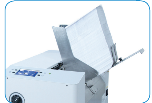
Integrated feeder holds up to 500 envelopes