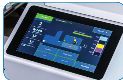
Intuitive 7" color touchscreen displays system status, image preview, and provides access to stored jobs