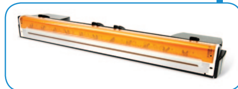
Memjet® print head has 70,400 ink nozzles for higher speeds, lower ink use and less noise than standard print heads