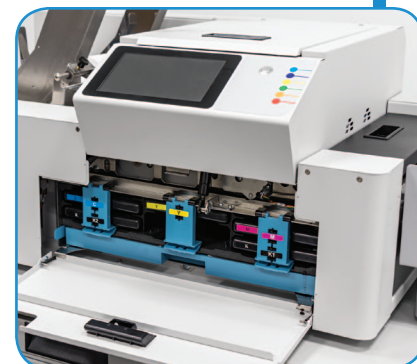
Clamshell design offers easy front access to ink tanks and paper path