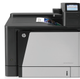
HP Color LaserJet Enterprise M855dn Printer