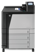
HP Color LaserJet Enterprise M855xh Printer