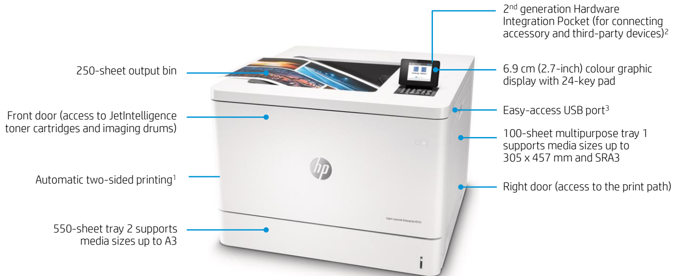
HP Color LaserJet Enterprise M751 dn