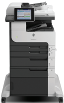
HP LaserJet Enterprise MFP M725f