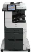
HP LaserJet Enterprise MFP M725z+