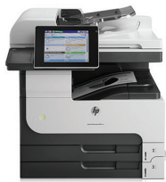
HP LaserJet Enterprise MFP M725dn

Enable large-volume printing on a wide range of paper sizes—up to A3—with a 4600-sheet maximum input capacity. 2 Preview and edit scanning jobs. Centrally manage printing policies. Safeguard sensitive business information.